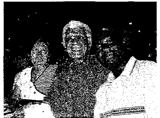
A couple of baseball novices ham it up at the Jackhammers game