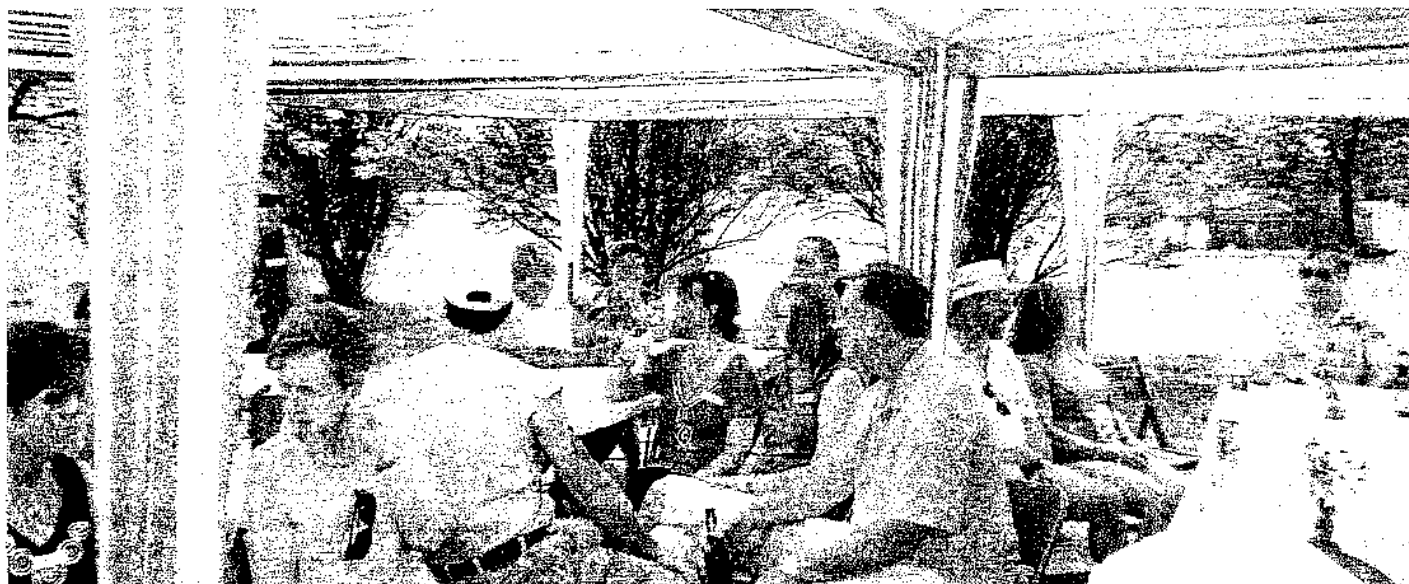
ABOUT 40 KNIGHTS AND THEIR WIVES HAS A GREAT TIME AT THE ANNUAL COUNCIL PICNIC