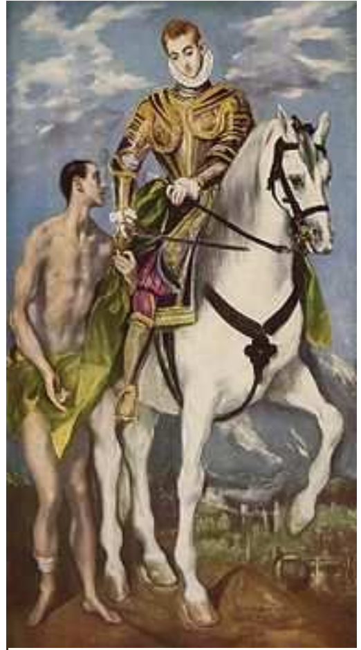
"St Martin and the Beggar" (El Greco)