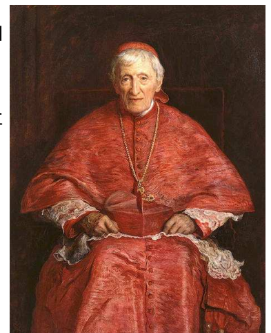
Blessed Cardinal John Newman

As part of our duty to evangelize, it is important that each Knight give serious thought to being generous in donating to this worthy cause. For many years men of our order worked very hard to become “Century Donors” to the Newman Club. The tradition goes back at least as far as 1950 when $100 was much more valuable and harder to come by than it is now. Why not be part of this wonderful tradition? Contributions can be by check or by credit card.